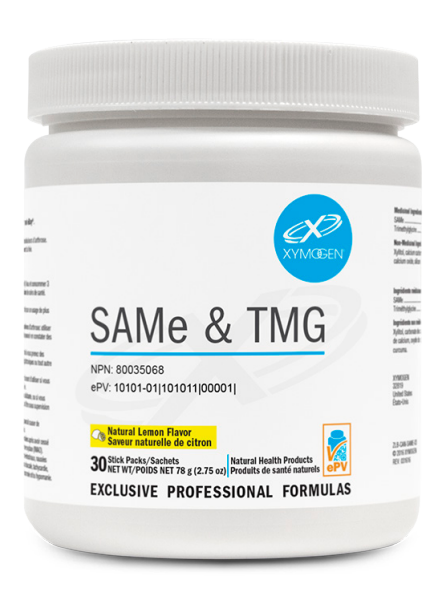
Available in 30 stick packs